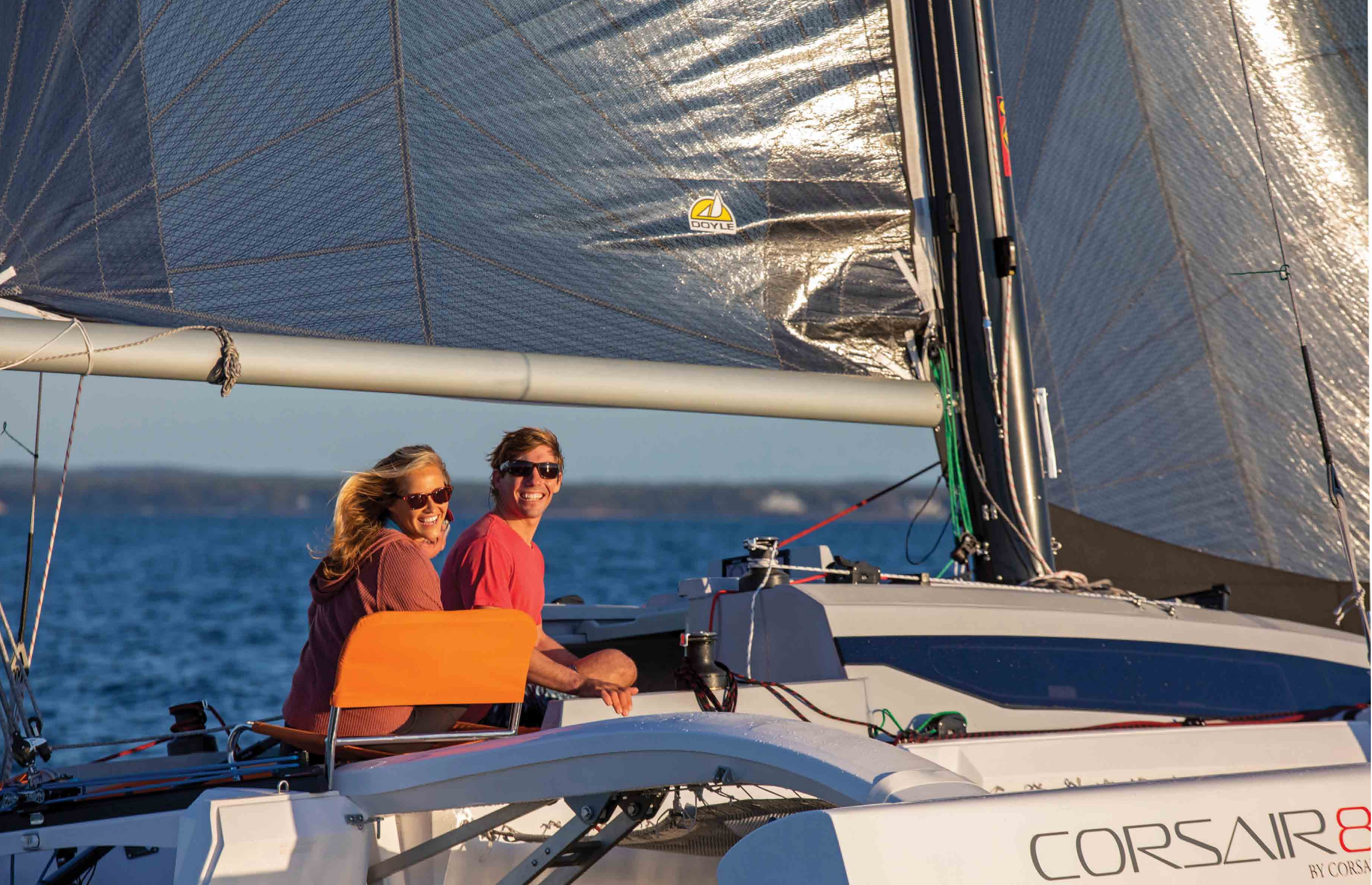
YOUTUBER'S TULA'S Endless Summary toured North America by sea and by road.