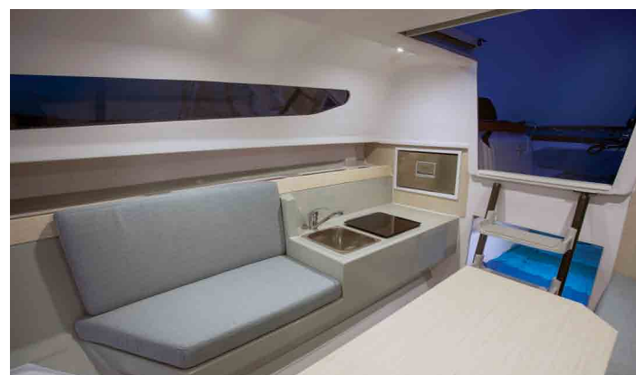
GALLEY and seating.