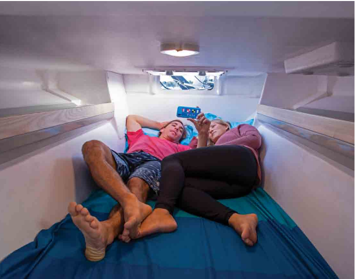
TWO double cabins.

But some comfort is also offered in the cockpit with large seats with backrests and a dodger and Bimini to provide shelter. Space is allowed for 200W of solar panels