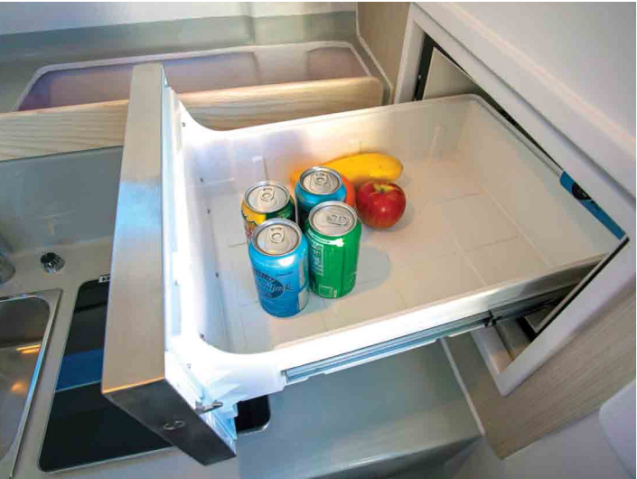
GALLEY with fridge.