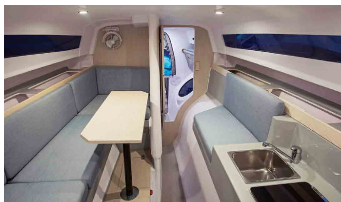
FULL headroom in saloon.

3 - Performance : The feeling is undeniable when you only need a few knots of wind to get the boat moving in flat conditions without whitecaps. But if you want to push the boat in race mode in fresher conditions, you can easily be sailing in excess of 15kts off the breeze, out point monohulls into the wind and yet remain relatively level when doing so.